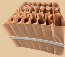
Pop & Drop (without container)