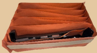
Pop & Drop with Parts