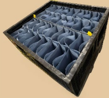
Blue Plush Centerspilt