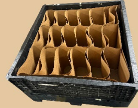
Bulk Bin Pop & Drop