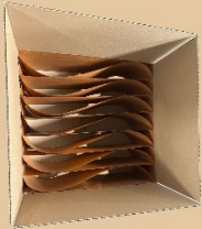
Nomar In The Box