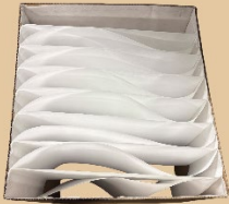
Elite In The Box