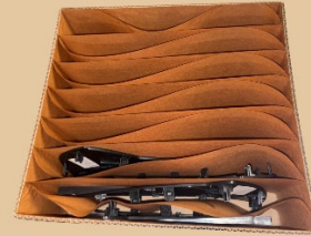
In The Box with Automotive Parts